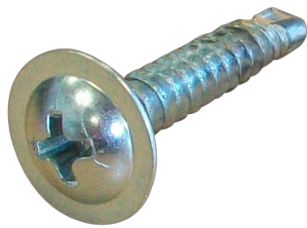
Vis ossature plaque de plâtre