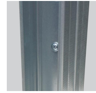
Vis ossature plaque de plâtre - montants dos à dos