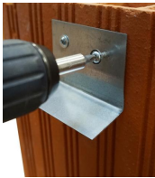
Vis à brique - vue en situation