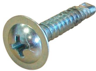
Vis à brique

Self-tapping screw can be screwed directly into brick