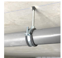
Rapido M8 - vue en situation