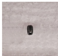
Rapido - Vue en situation