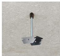
Rapido M6 - vue en situation