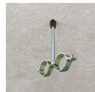
Rapido M7 - vue en situation