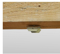
Piton rénovation mâle M6 + cavalier