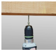
Piton rénovation mâle M6 - mise en oeuvre