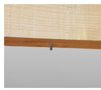
Piton rénovation mâle M6 - vue en situation