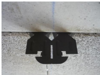
Suspente hourdis béton - vue en situation