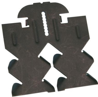
Suspente hourdis béton