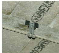
Suspente hourdis béton + suspente bois