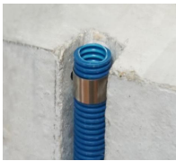
STOP-RING - vue en coupe