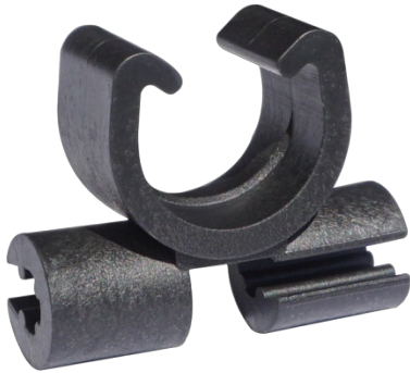
FIX-RING STEEL simple