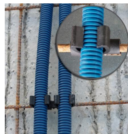
FIX-RING STEEL - vue en situation électricité