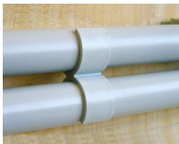
FAST-RING - vue en situation