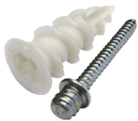
Cheville Plak nylon avec patte à vis M7