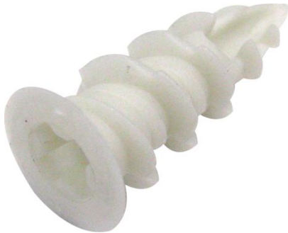
Cheville Plak nylon