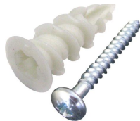
Cheville Plak nylon avec vis tête ronde