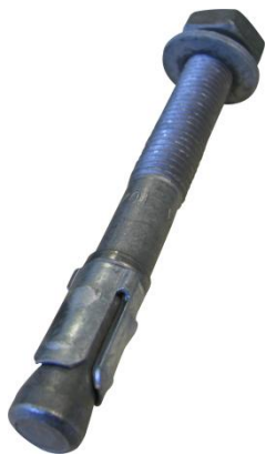
Goujon fileté galvanisé