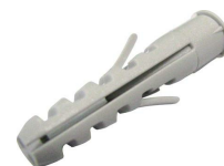
Cheville nylon à collerette