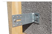
Cheville parpaing - Vue en situation